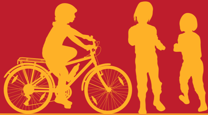
Calories burned per minute by children doing different activities 7