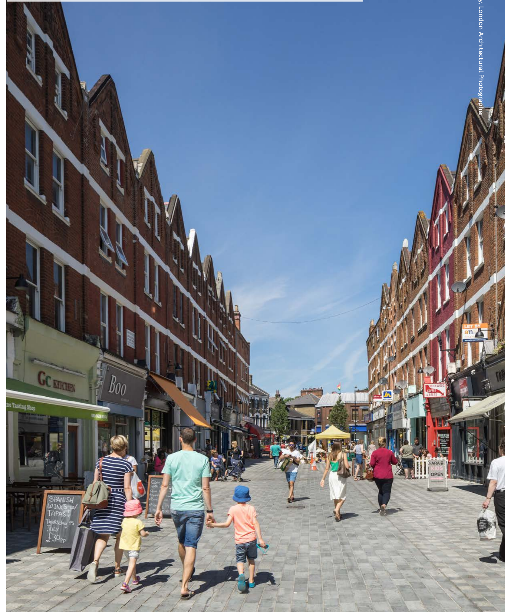
Hildreth Street, Balham