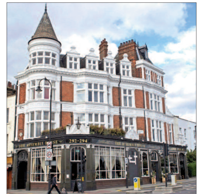
▲ The Assembly House, Kentish Town Road, Grade II listed