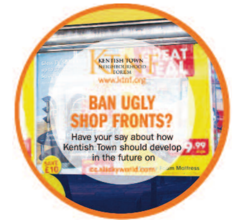
▲ One of several beer mat designs

We were aware that a number of people do not use computers, so Creative Citizens organized workshops to discuss how to inform that part of the community. One idea that came up was to produce beer mats showing policy and project ideas and images and giving contact details. These were distributed to pubs and cafés in the Neighbourhood Forum Area.