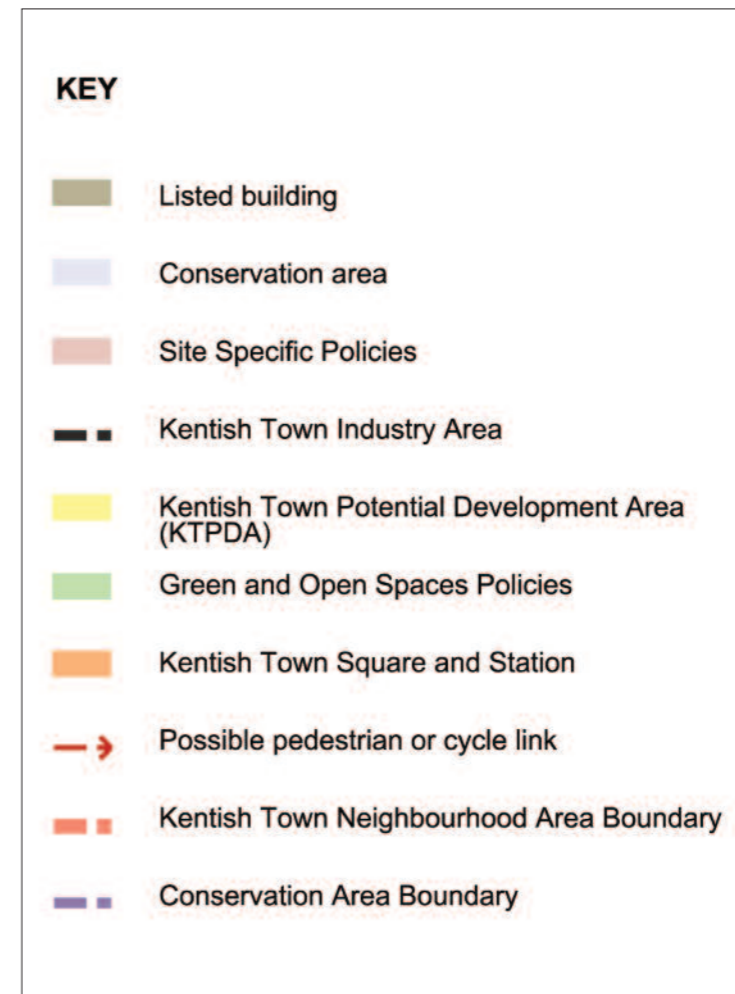
Map Credits: Alice Brown, Aaron Davies

Cover photographs from top left clockwise: Saint Benet and All Saints Church Garden; The Canopy; Railey Mews; Canteloves Skatepark