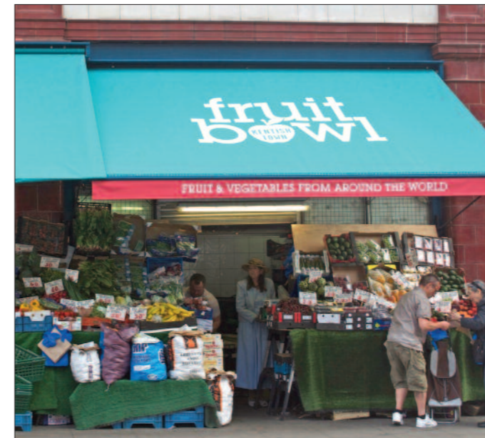
▲ Fruit Bowl outside Kentish Town Station

and no improvements are programmed by the water company, then the developer needs to contact the water company to agree what improvements are required and how they will be funded prior to any occupation of the development.