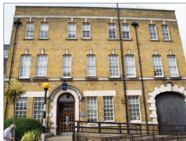
▲ The Police Station, Holmes Road. Grade II listed